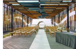
Boardroom - Cherki